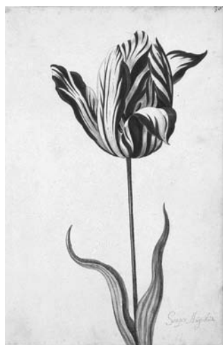
FIGURE 1.1 Semper Augustus was one of the most-prized varieties of tulip.

speculators to make the trip to Amsterdam, so smaller exchanges appeared in the taverns of small towns using similar trading rules as had been established in the capital city. To create an atmosphere of prosperity and opulence, these taverns were often adorned with large vases of tulips in full bloom and sumptuous dinners that traders could enjoy while doing their business.