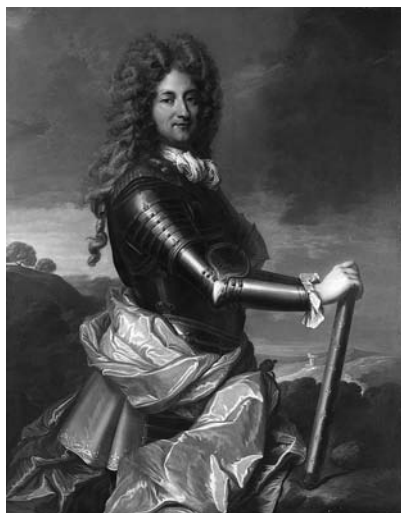
FIGURE 2.4 Philippe II, Duke of Orléans, was instrumental in putting Law in a position of great influence and power. He is shown here in a painting by Jean-Baptiste Santerre.

As France's de facto treasurer and finance secretary, Law also focused on the revival of overseas commerce. These pro-business measures aided the country with an increase in industrial output of 60 percent over two years. One simple metric that illustrates the power of Law's actions was that the number of French ships engaged in export jumped from merely 16 to a full 300 (see Figure 2.4).