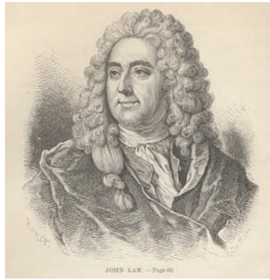
FIGURE 2.2 John Law shown in a contemporary lithograph.

Back in his native Scotland, Law published a proposal for what he called a Land Bank. The idea was relatively simple: a given country (in this instance, Scotland, Law's native land) would "deposit," in a sense, the value of all its land holdings into a national bank. The bank, in turn, would issue notes whose collective value would never exceed the entire value of the land on deposit. These notes, each of which represents a tiny portion of the country's land-based wealth, would be the kind of paper money that Law envisioned as a more efficient means of exchange. It was a way of monetizing the value that the country already owned but had not yet unlocked—in this instance, the land—and pumping that value into the nation's economy.