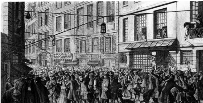
FIGURE 2.5 The Rue de Quincampoix . The street, near the Bourse, in which Law established his Banque Generale in 1716; after a contemporary engraving.

Of course, those lucky enough to own property on the heretofore unremarkable street enjoyed the dividends of this mania. Homes that in saner times had rented for $1,000 per year now yielded 16 times that amount. A cobbler rented out his tiny stall for $200 per day so that a trader could have