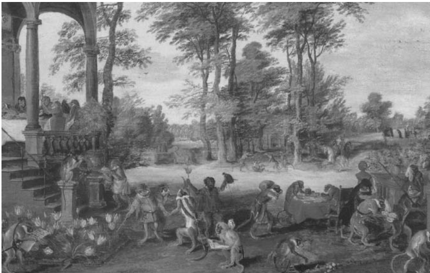
FIGURE 1.3 Jan Breughel's famed The Folly of Tulip Mania , painted in 1640 and displayed at the Frans Hals museum in Haarlem.

The Dutch lunacy spread somewhat beyond its borders, creating miniature tulip frenzies in London and France, but attempts by brokers to push tulip prices to the levels seen in Amsterdam met with only moderate success. Even if the tale of flower-bulb speculation from long-ago Holland is more fiction than fact, it still is a fascinating anecdote into how the novelty of a new product (in this case, a flower, as opposed to an iPhone) can capture the public's imagination, if only for a few months (see Figure 1.3).