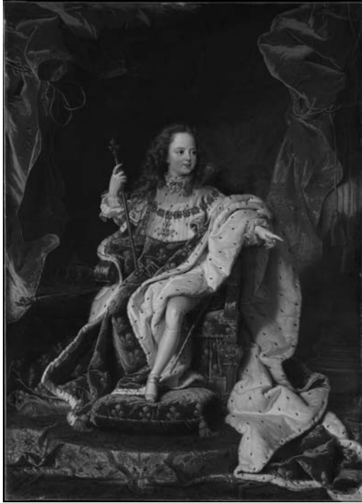
FIGURE 2.3 Louis XV as a child in his coronation robe, as painted by Hyacinthe Rigaud, on display at the Metropolitan Museum of Art in New York City.

Law proposed to the court that a great nation such as France should not be shackled by the inadequacies of a metal currency. France need not be a pioneer in this area, either, as both Great Britain and Holland had adopted paper money with success. Law proposed the establishment of a new bank that would manage the royal revenues and issue notes based on landed security, very similar to the scheme that had been rejected by Scotland.