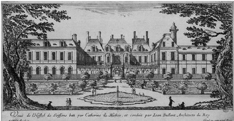
FIGURE 2.6 Copperplate engraving of the Hôtel de Soissons drawn circa 1650 by an unknown artist.

As soon as Law had secured the property, an edict was passed stating that the only lawful place for the trading of securities was within the gardens of Hotel de Soissons (see Figure 2.6). Amidst the trees of the gardens, no fewer than 500 small tents were set up so that traders could conduct their business with some shade as well as a sense of place. The prince, already wealthy, enjoyed an avalanche of cash, as each of the tiny tents rented out for $500