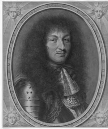
FIGURE 2.1 Louis XIV, King of France, by the French engraver and artist Robert Nanteuil.